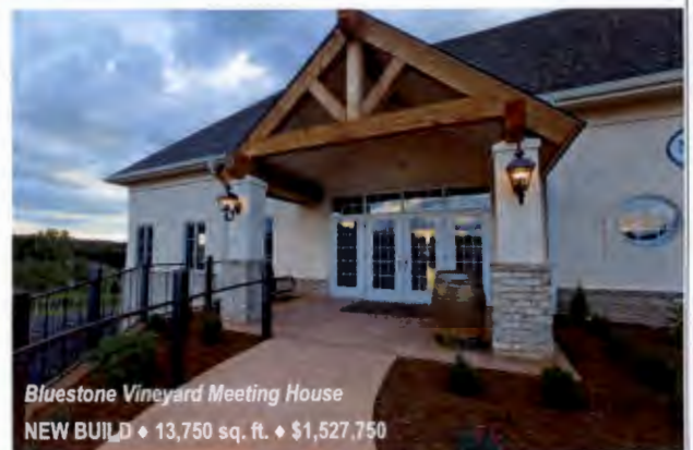
Bluestone Vineyard Meeting House NEW BUILD • 13,750 sq. ft. • $1,527,750