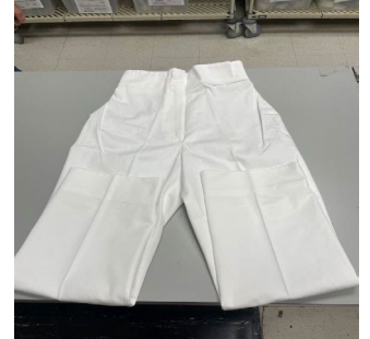
HIGH RISE WHITE TROUSER