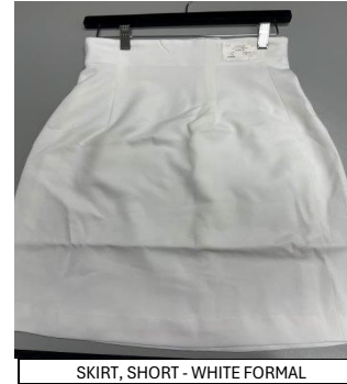
SKIRT, SHORT - WHITE FORMAL