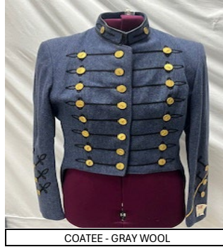
COATEE - GRAY WOOL