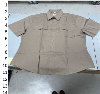
AGSU SHORT SLEEVE SHIRT - ENLISTED