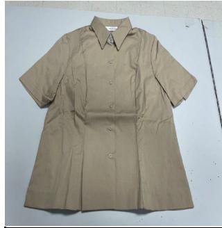
AGSU SHORT SLEEVE OVERBLOUSE - ENLISTED