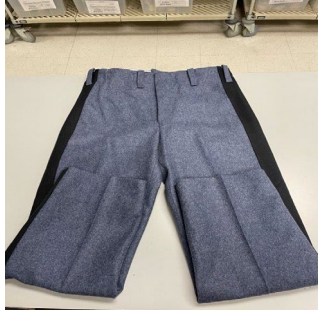
REGULAR RISE WOOL TROUSER