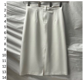
BACK VIEW OF SKIRT - ALL THE SAME ZIP/BUTTON CLOSURE KICK PLEAT