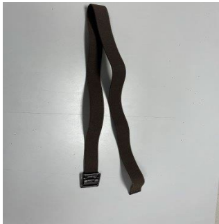
AGSU ELASTIC BELT w/BUCKLE