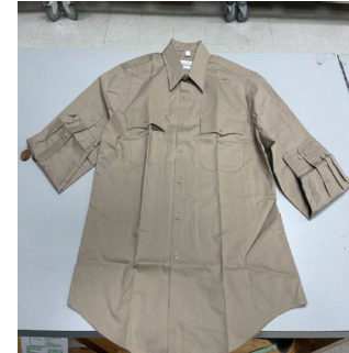
AGSU LONG SLEEVE SHIRT - ENLISTED