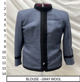
BLOUSE - GRAY WOOL