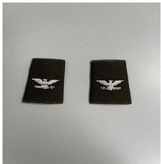
COLONEL (COL) - SMALL FEMALE