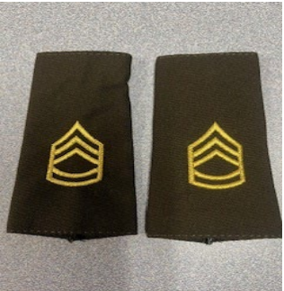
SERGEANT 1st CLASS (SGT 1/C)