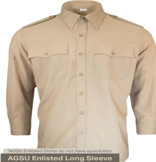
AGSU Enlisted Long Sleeve