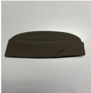
AGSU GARRISON CAP