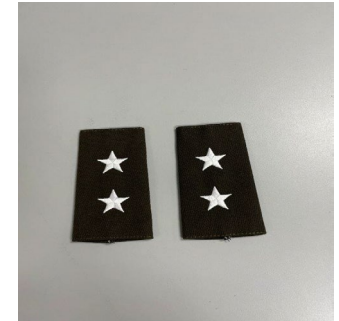
MAJ GEN (MG) - LARGE MALE