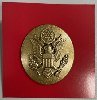
CAP DEVICE - ENLISTED