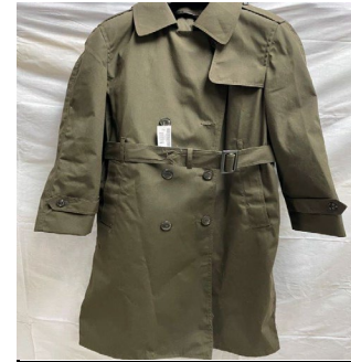
AGSU ALL-WEATHER COAT