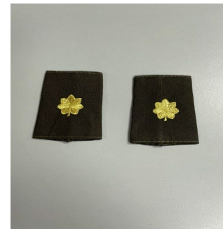
MAJOR (MAJ) - SMALL FEMALE