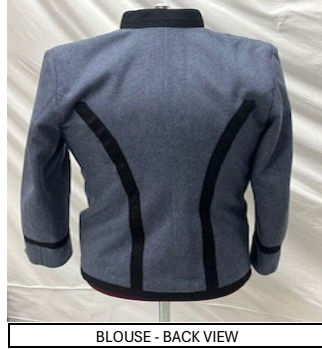
BLOUSE - BACK VIEW