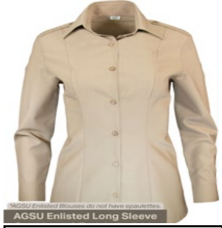
AGSU Long Sleeve Overblouse - ENLISTED