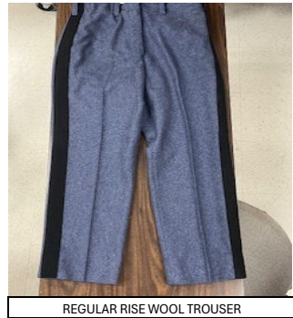
REGULAR RISE WOOL TROUSER