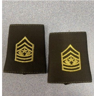
COMMAND SERGEANT MAJOR (CSGM)