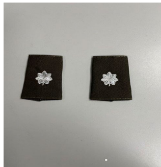
LIEUTENANT COLONEL (LTC) - SMALL FEMALE