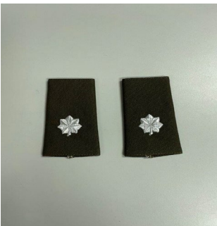
LIEUTENANT COLONEL (LTC) - LARGE MALE