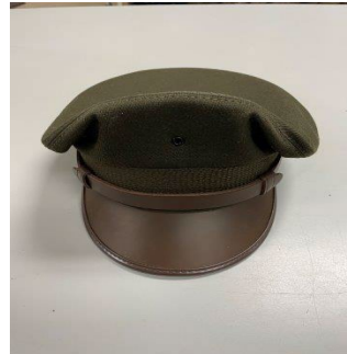
AGSU SERVICE CAP