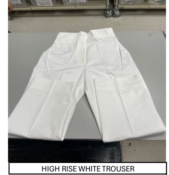
HIGH RISE WHITE TROUSER