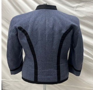
BLOUSE - BACK VIEW