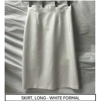
SKIRT, LONG - WHITE FORMAL