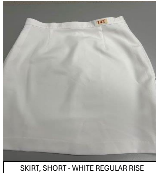
SKIRT, SHORT - WHITE REGULAR RISE