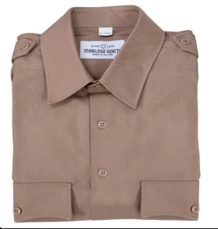
AGSU SHORT SLEEVE OVERBLOUSE - OFFICER