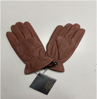
AGSU - GLOVES MALE/FEMALE