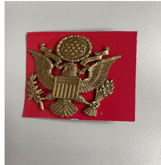
CAP DEVICE - OFFICER