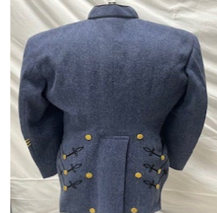
COATEE - BACK VIEW