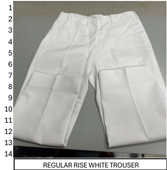
REGULAR RISE WHITE TROUSER