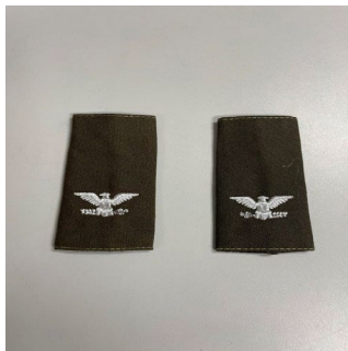
COLONEL (COL) - LARGE MALE