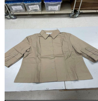
AGSU LONG SLEEVE OVERBLOUSE - OFFICER