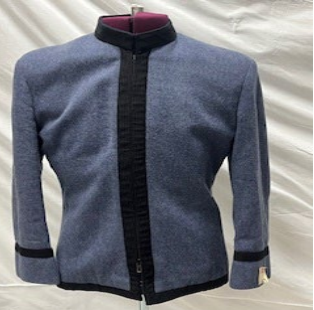
BLOUSE - GRAY WOOL