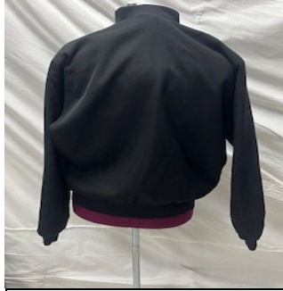
DUTY JACKET - BACK VIEW