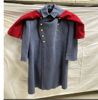
OVERCOAT W/CAPE SHOWING