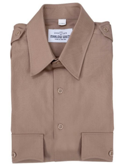
AGSU SHORT SLEEVE SHIRT - OFFICER