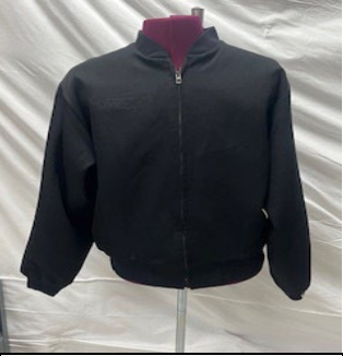
DUTY JACKET W/ELBOW PATCHES - BLACK