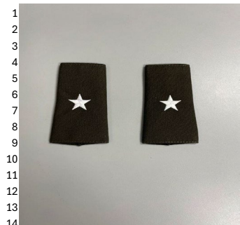
BRIG GEN (BG) - LARGE MALE