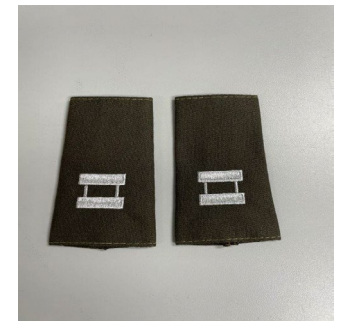
CAPTAIN (CAPT) - LARGE MALE