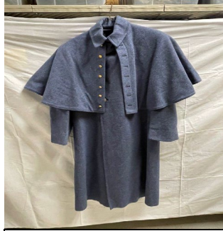
OVERCOAT - GRAY WOOL