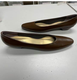
AGSU DRESS PUMP