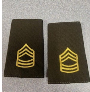
MASTER SERGEANT (MSGT)