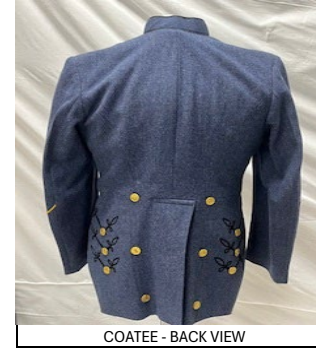
COATEE - BACK VIEW