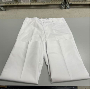
REGULAR RISE WHITE TROUSER