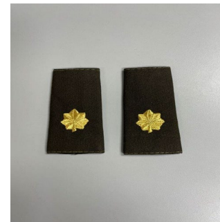
MAJOR (MAJ) - LARGE MALE