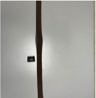
AGSU WEB BELT - AGSU BUCKLE