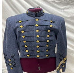
COATEE - GRAY WOOL